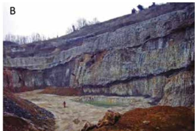
Fig. 4 – The gypsum area in Piedmont region [A]:The hilly landscape around Monferrato mostly carved in the Post-evaporitic sediments of Messinian age; [B]:The main macrocrystalline gypsum beds exposed at the surface in the open pit quarry at Moncalvo (Modified by Vigna et al. , 2017).