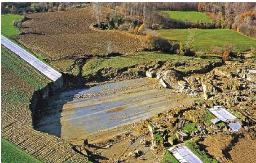
Fig. 6 – Planar landslide immediately after failure. Typical landslide body displaced by a planar sliding mechanism (modified by Bottino et al. 2011).