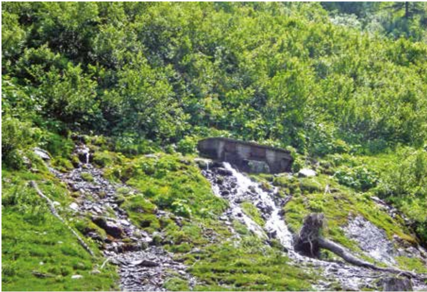
Fig. 3 – Typical fracture spring in Germanasca Valley near Turin (Gizzi et al. , 2019).

influenced by the fractures in the host rock. In the area of Moncalvo and Calliano the surface topography is characterized by a series of gentle hills mostly carved into the post-evaporitic sediments (marls and clays) (Fig. 4A). The evaporite beds are inclined 10-20° and are mostly buried underneath the Late Miocene-Pliocene sediments (Fig. 4B). The underground quarries in this gypsum follow the overall geometry of these evaporite bodies and intersect different aquifer levels. A series of boreholes with piezometers, together with kilometers of quarry galleries excavated in the gypsum have allowed