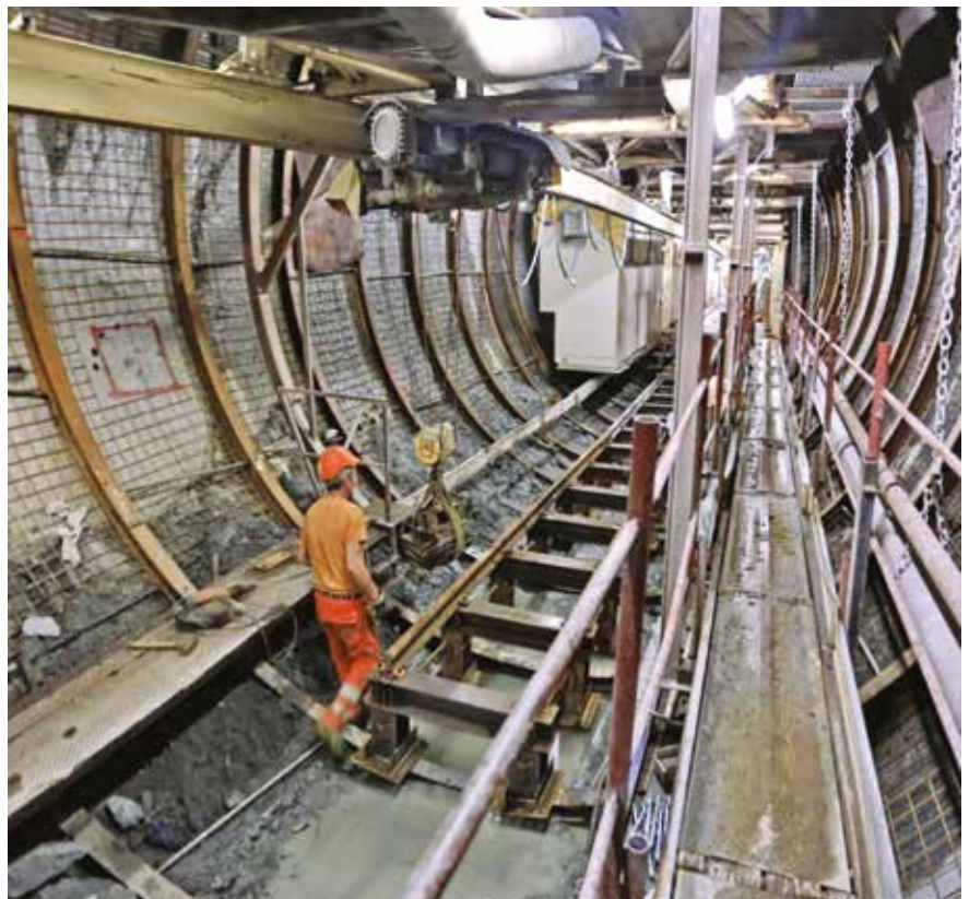
Fig. 9 – Realization phase of “La Maddalena” exploratory adit (Lo Russo et al. , 2019).

for the future Base tunnel realization. In fact, one of the main task in the optimization of the final design of a Tunnel has been represented by the hydrogeological monitoring. This activity has