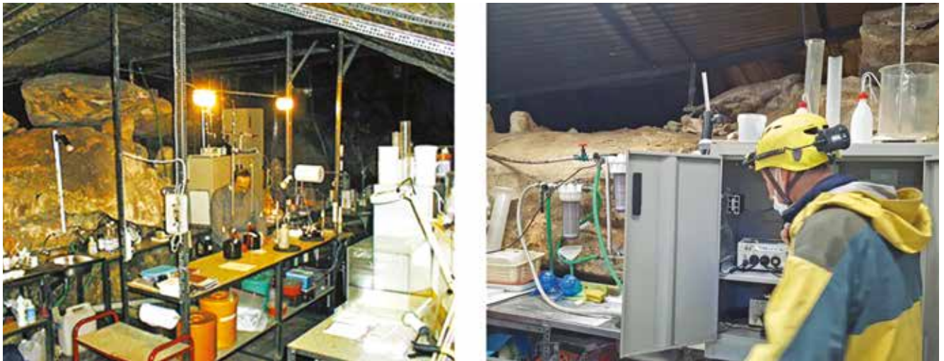
Fig. 5 – Underground Karst Laboratory of Bossea with sophisticated instruments.

ology. Several tracing experiments and the continuous monitoring of the dye tracer arrivals in different spots have enabled to build an increasingly detailed map of the different zones that recharge the Bossea karst aquifer.