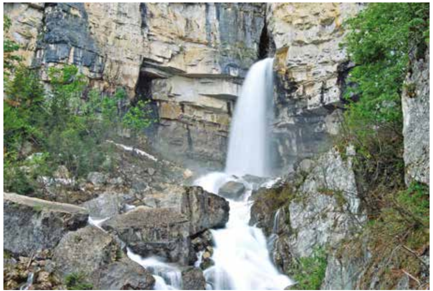
Fig. 2 – The karst spring, this particular spring is named “Pis Spring” in Cuneo area near Turin and this is a very famous Piedmont spring.

se fractures network (relative low permeability) (Fig.2) (Vigna, Banzato 2015; Filippini et al. , 2018).