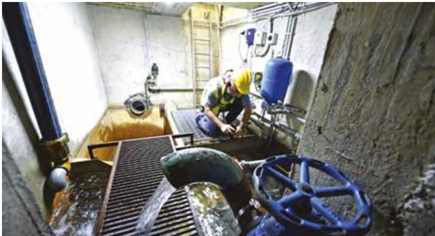
Fig 10 – Hydrogeological monitoring in “La Maddalena” exploratory tunnel.

been aimed to verify the correctness of the project hypothesis and specially to evaluate the inflow forecast in term of discharge rate and distribution, temperature and chemical facies of groundwater. The hydrogeological monitoring has proved extremely valuable not only in checking the reliability of the tunnel design forecast but also in underlining the importance of the realization of exploratory tunnels prior to the excavation of a main tunnel. Thanks to the hydrogeological and temperature monitoring of the main water inflow “La Maddalena” exploratory adit can also represent in perspective a very interesting possibility to exploit the related geothermal potential (Fig. 10).