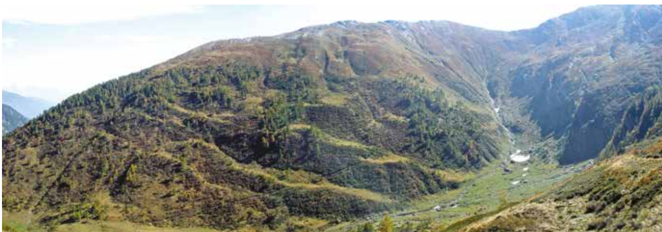
Fig. 7 – Deep Seated Gravitational Slope Deformation (DSGSD) in Rodoretto Valley in Germanasca Valley near Turin.

In addition, some water mountain sources, many of which potentially exploitable for drinking purposes, have been identified along the longitudinal trenches mapped in the upper sector of Rodoretto Valley: by mean exclusive geological investigations it was therefore possible to demonstrate how the pattern of the hydrographic network is strongly affected by the recognized gravitational features (Forno et al. , 2012).