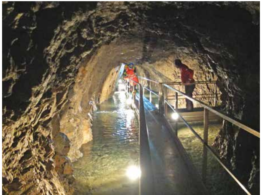
Fig. 8 – Hydrogeological monitoring of Tenda tunnel.

The second important project that developed by Diati AGg regarded the “La Maddalena” exploratory tunnel. “La Maddalena” exploratory tunnel, located in Chiomonte (Italy Western Alps – Susa Valley), is one of the four exploratory adits, three in France, completed in 2010, and one in Italy, whose realization is rela-