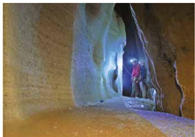
Fig. 11 – Ice-deposits in karst cavities.