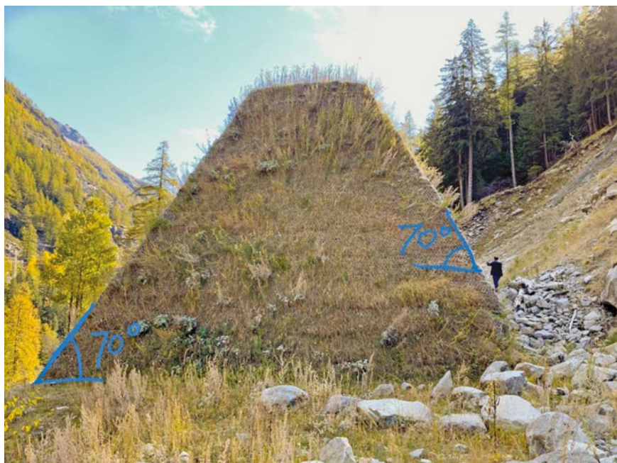
Fig. 1 – Reinforced earth rockfall protection embankments, Cogne, Valle d'Aosta Autonomous Region, Italy.

assured, as the huge weight of the embankment might represent an unfavourable effect.